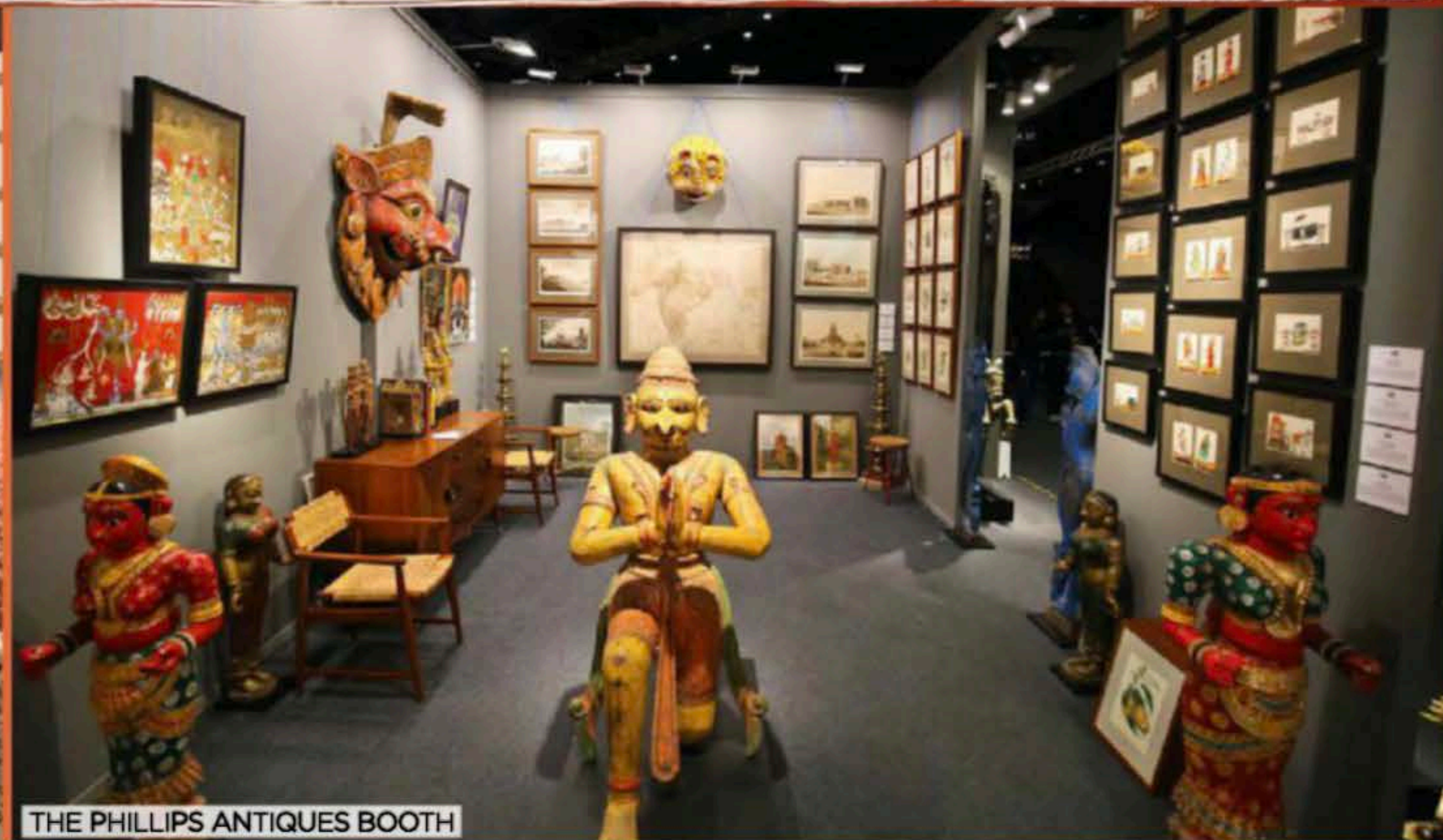
THE PHILLIPS ANTIQUES BOOTH